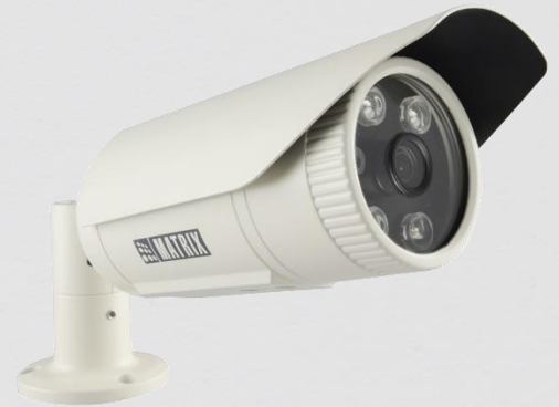
SATATYA CIBR20FL36CW-S 2MP IR Bullet Camera with 3.6mm Lens

Matrix project series IP Cameras are built using superior components such as Sony STARVIS sensor and higher MTF lens to offer unmatched image quality especially during the low light conditions. Powered by True WDR algorithm, these cameras offer consistent image quality even in highly varying lighting conditions. Built in intelligent analytics including Intrusion Detection, Trip Wire, etc. ensure real-time security. Moreover, H.265 compression and Automatic Motion based Frame Rate Reduction save bandwidth and storage up to 50%.